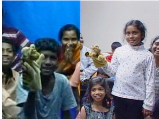
A conversation through puppets. From the Oct. 2004 Chennai-Philadelphia videoconference. (Figure 3.)