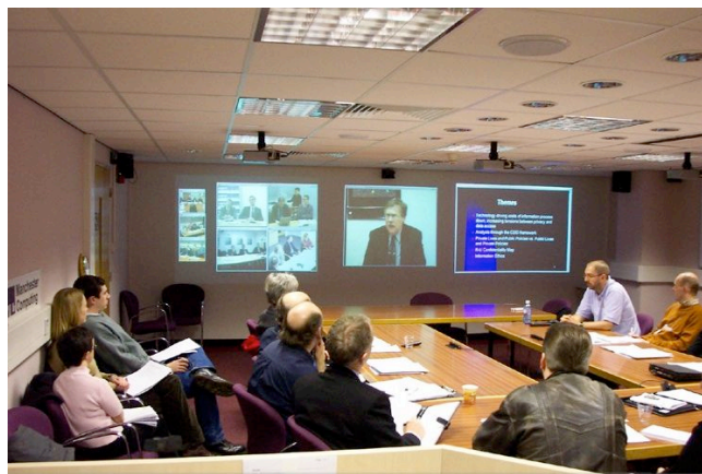
An Access Grid videoconference. (Figure 4.)