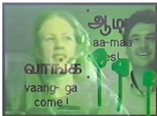
A videoconference featuring electronic drawing and Tamil words (with transliteration and translation). (Figure 1.)

Years ago, people could often be heard in Tamil Nadu's browsing centres, singing Tamil cinema songs to distant others. Browsing centres have decreased, as Internet connectivity in the home, school, and office -- and on portable communication devices -- has increased. However, Tamil Nadu has been a world leader in bringing tribal, folk, and classical performing arts into the realm of cinema. Now these arts -- along with the teaching-and-learning of the Tamil language itself -- should be brought into the realm of videoconferencing, to further enable the sweet sound of Tamil to be heard and spoken around the globe.